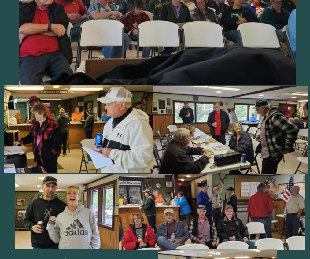
WHPA Fall Meeting Candid Photos