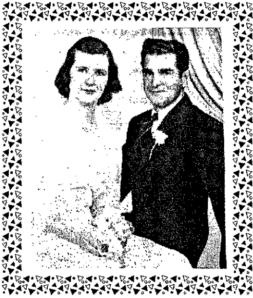
ANYBODY RECOGNIZE THIS COUPLE? HINT: picture goes back to 1946 See page 6.

Unfortunately, The Millshop now needs the space. The Club will have to find a new home for next year.