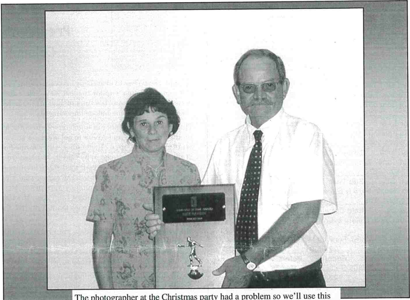
The photographer at the Christmas party had a problem so we'll use this picture of Dick's induction into the HOF at the World..