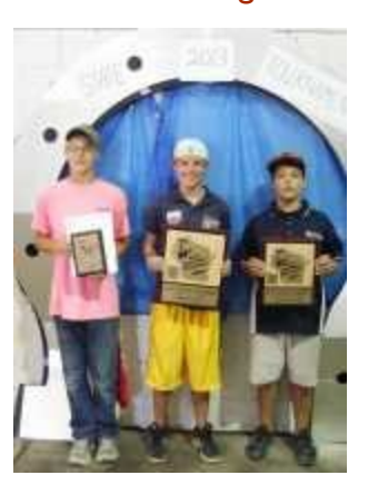
Jr. Boys Championship