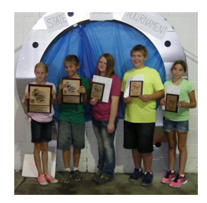
Jr. Mixed A