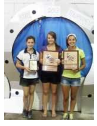
Jr. Girl's Championship