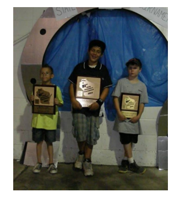
Cadet Boys Championship