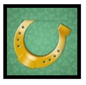
Classes I & J on the right