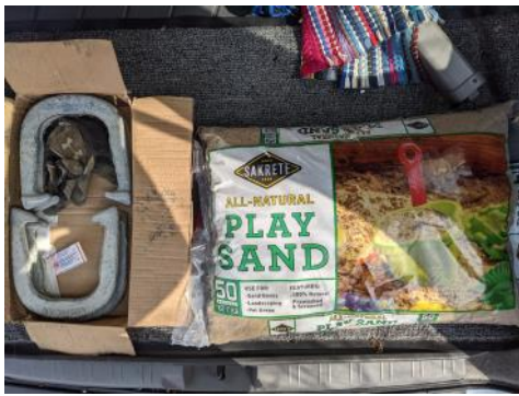
Cruel Shoes Continued

Ah, but not to avoid the topic of my own black market chicanery. This utilitarian meddling had a purpose, of course, in better playing, for myself and those handful of others at the Humboldt Park pits. My own games after this caper were played in solitary, and poorly at that. I would like to blame a heavy conscience, if it were so heavy as to weigh down my pitching elbow or fatten my fingers. No, these crimes in bad playing were mine alone, though, after the second game, I eventually regained my form. Gambol accomplished, I snuck back home for a bloody Maria and a couch with all the windows open. For all the grains of sand on Lake Michigan, I was far guiltier of avoiding yardwork and tossing a day to leisure. So to you I submit my crime – public idiocy, in the 17 th degree.