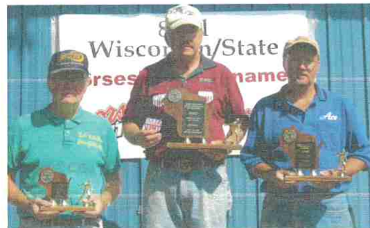
2005 State Tournament Stock Photo

If anyone is interested or willing to help our Club out with the state tournament we would be happy to have you.