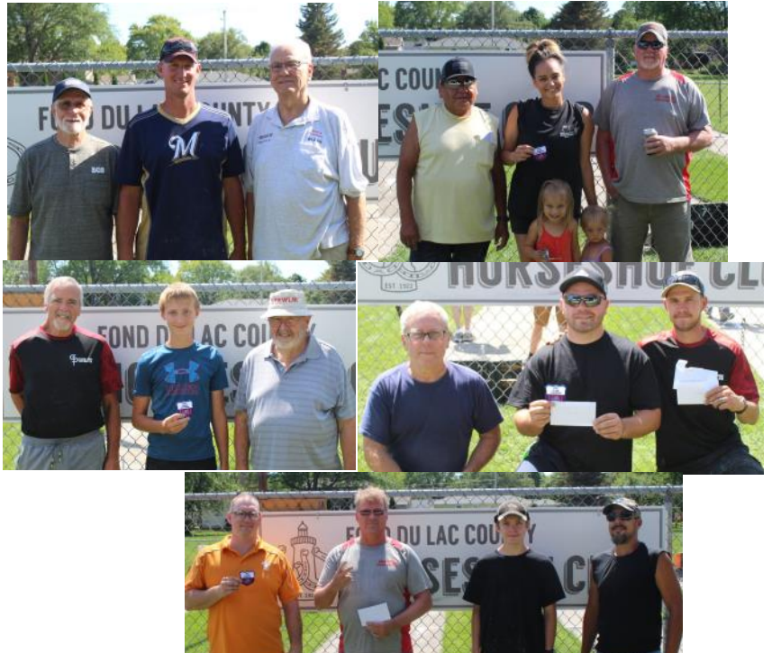
Fond du Lac Winners (above)