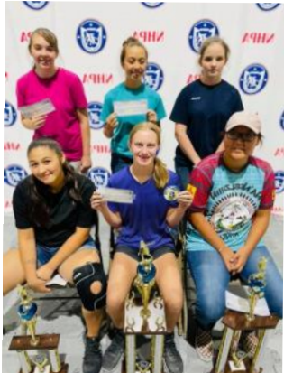
WT Junior Girls Championship