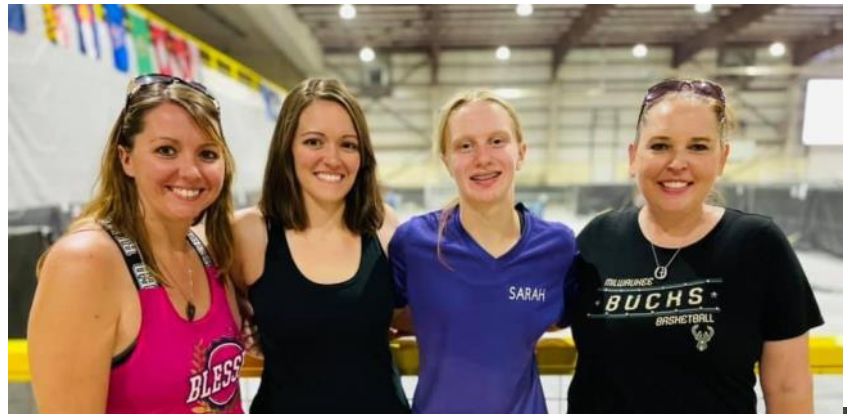
WHPA WT Winners