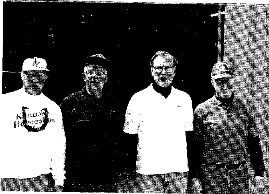
KENOSHA - 97 CLUB TEAM CHAMPIONS CLASS B

Notice to indoor tournament directors: Please contact the Newsletter now with dates. WHPA Indoor list will publish all sanctioned and WHPA approved event. Others published as "Coming Events."