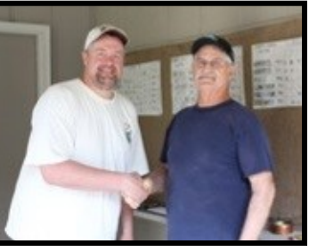
Class B Champion