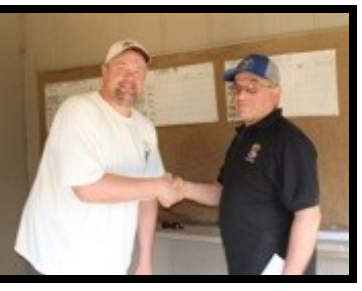
Class D Champion