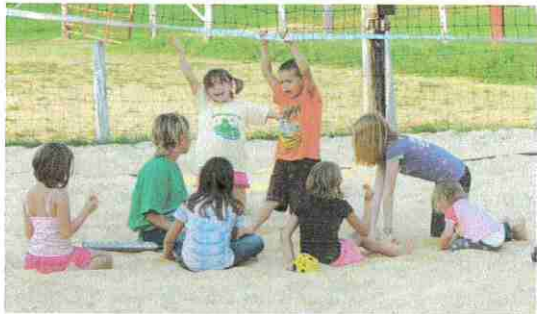
Sand volleyball court, a big hit with the kids