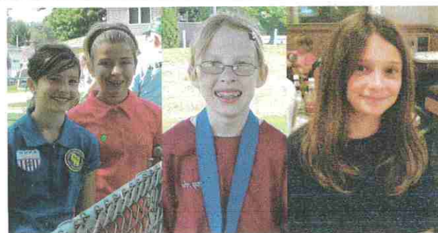
Junior Girls Class A