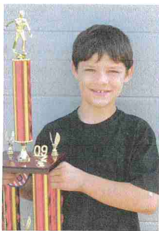
BOYS CADET CHAMPION