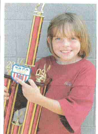
GIRLS CADET CHAMPION