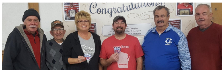
Deansville Doubles Pitchers