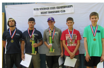
Boys / Girls Junior Championship Group Picture