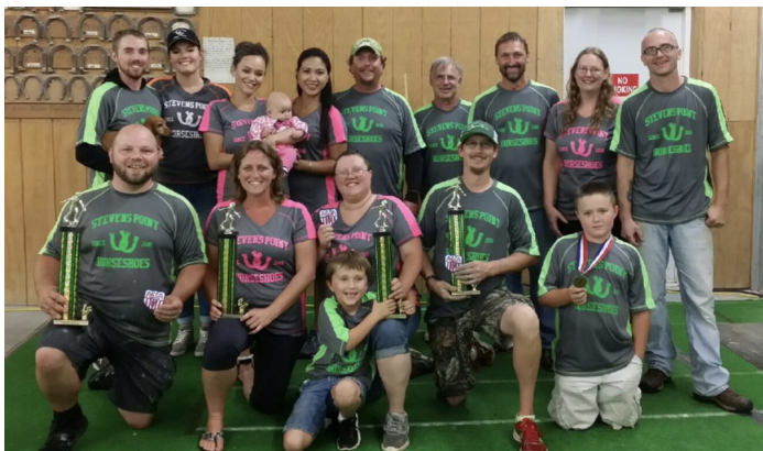
Pictured to the left is the Stevens Point Club sporting their team shirts and hardware earned at the 2017 State tournament. Quite an impressive group!