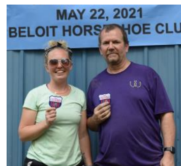
Another Horseshoe Family of Champions!