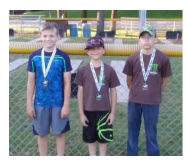
Arkdale Cadet Winners