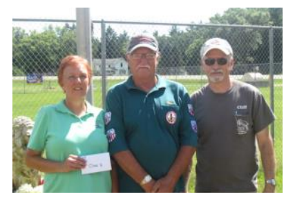
Arkdale Class B