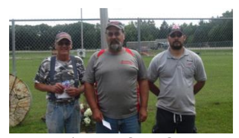
Arkdale Class C