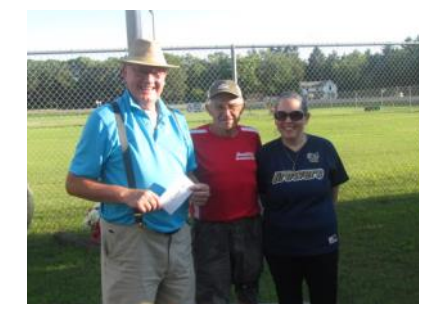
Arkdale Class A