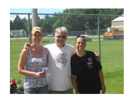
Arkdale Class D