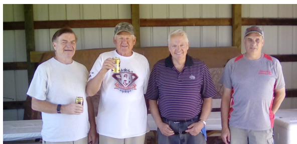
Eagle River Class A Left *****