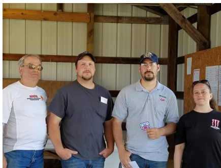
Eagle River Class D Lower Right